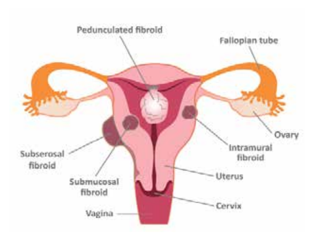
Figure 2: Different types of uterine fibroids