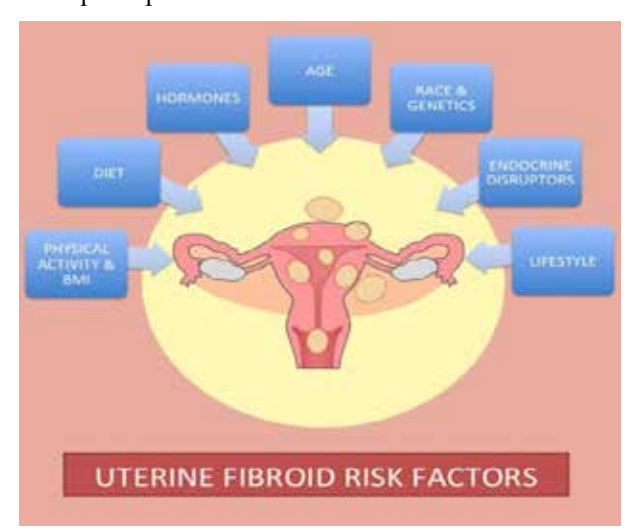
Figure 3: Risk factors affecting the incidence of uterine fibroids.

Myomas are the most common in women of the black race. Genetic factors can play a significant role in myoma development. The growth of multiple myomas in the same uterus implies that heritage plays an important role in myoma development, causing some women to be more predisposed than others.<sup>17</sup>