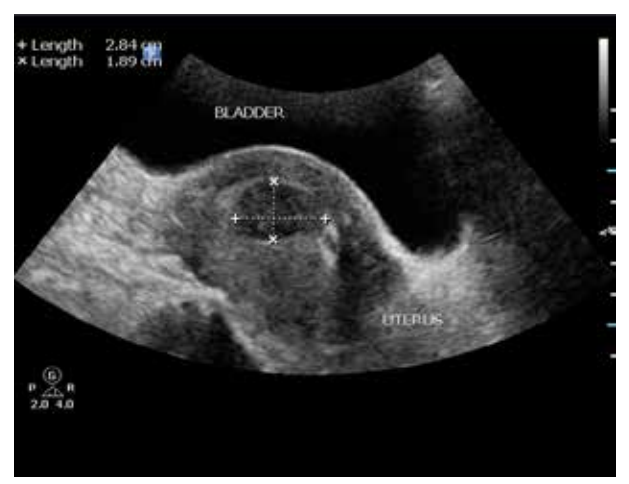
Figure 4: Ultrasonographic view of fibroid uterus

Blood Chemistry is done to assess the degree of anemia and other related factors if appropriate. Pap's smear is done routinely.